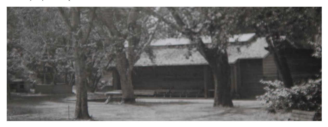
Frances Young Gallery, undated

At the Center, they were also quite active in one of the Founding groups, the Marin Society of Artists. One major project was supervising construction of the Frances Young Gallery for the Center in 1948. Even before this, he was active with the Artists in much of the preparatory work.